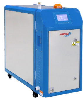
油式模温机 oil type mold temperature controller